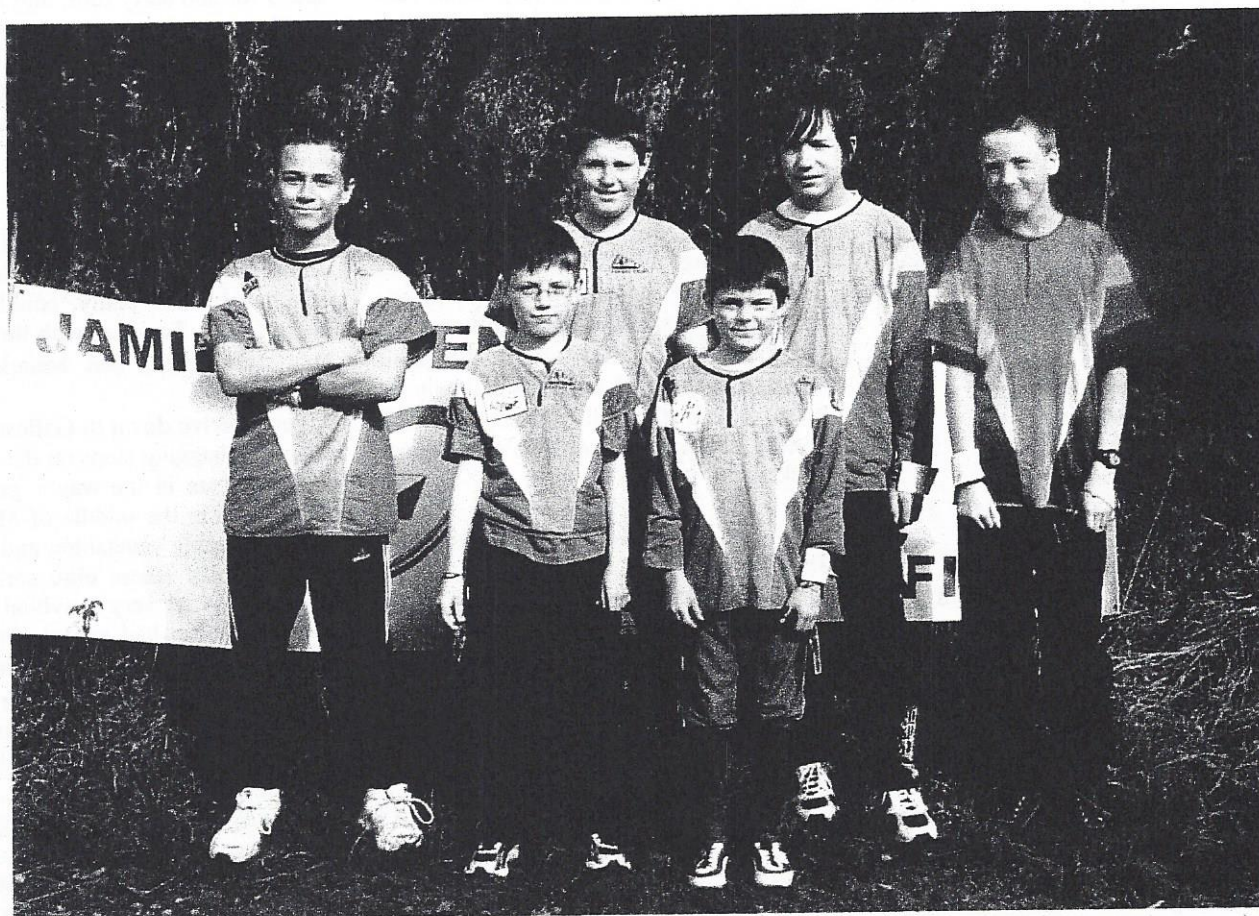
Interloper juniors at the Jamie Stevenson Trophy

There'll be some sort of food – soup, or whatever's easy – but anything else brought along will be gratefully received, and of course the chance to chat about maps and events in convivial company afterwards, too.