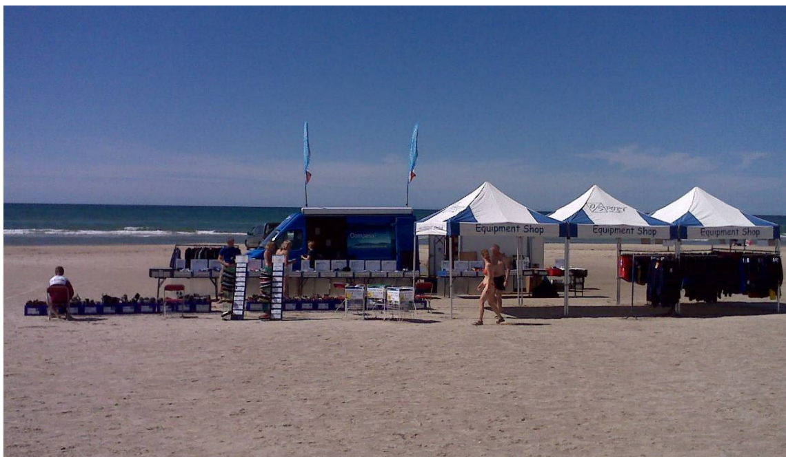
Compass Point event shop, Denmark JWOC 2010

The result of global warming in Scotland?!