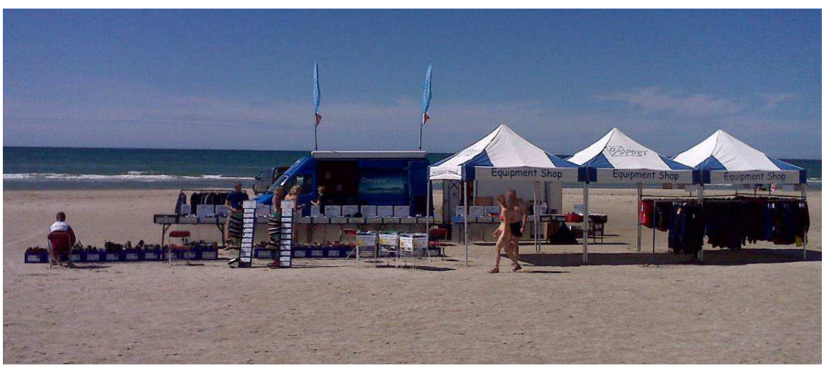
Compass Point event shop, Denmark JWOC 2010