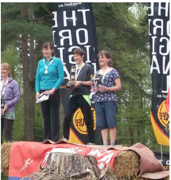
The INT W40 team

This year's BOC relays were, as usual, a fairly successful day for Interlopers. On the podium we had: