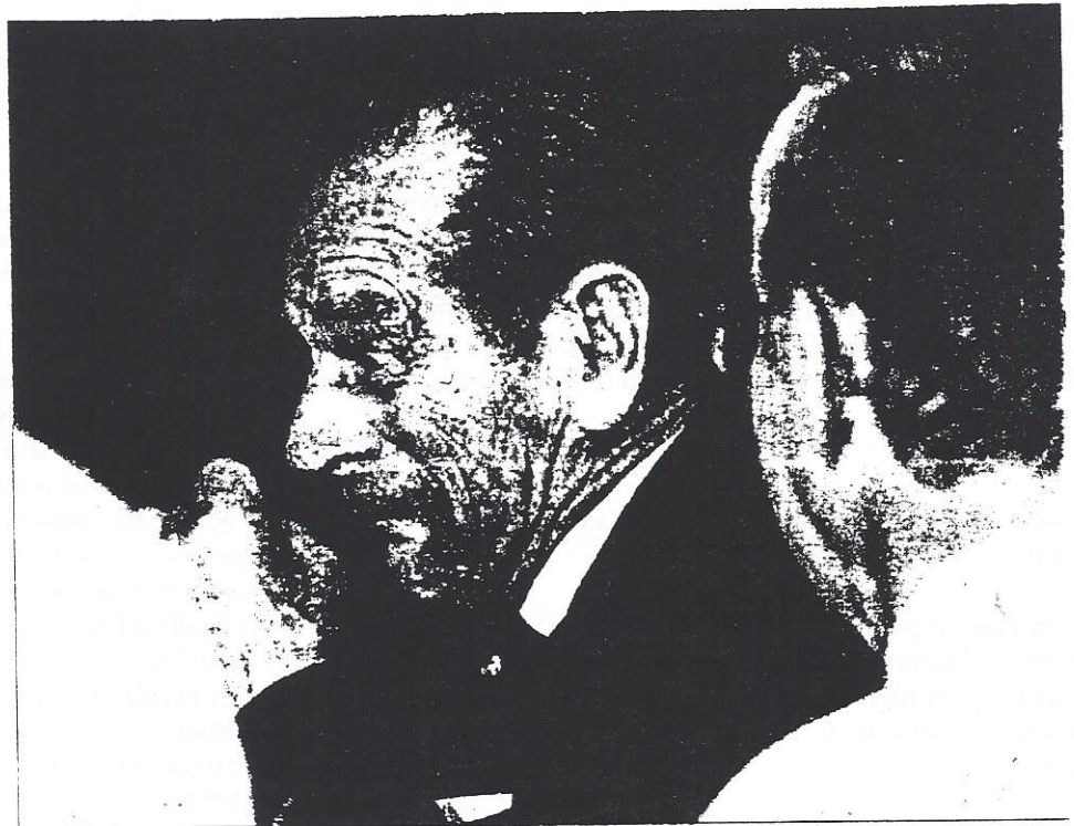
The Chairperson's Reaction On His Re-election !

And nothing remotely interesting inside at all !